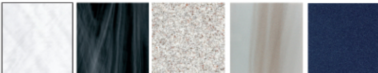
sterling silver pearl shadow moonscape desert horizon cobalt